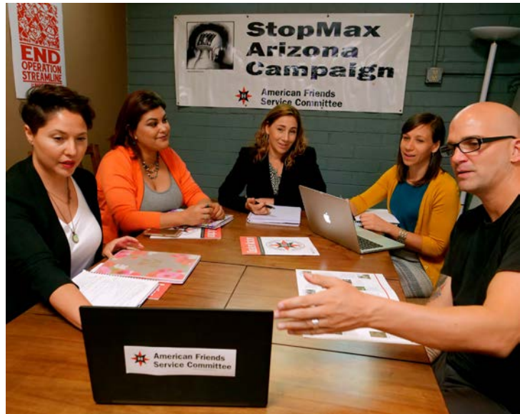
The AFSC-AZ Team

When I started out as an intern here at the Arizona office in 1995, criminal justice reform was a radical notion. Tough-on-crime was the buzzword, and speaking up for the rights of defendants or incarcerated people was dismissed as bleeding-heart naivete or maligned as undermining public safety.